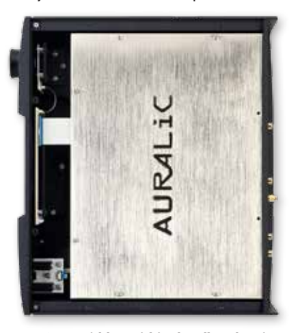
ABOVE: Hidden within the alloy chassis, and screening the circuitry within, is a branded nickel-plated copper enclosure

After listening to some early Alice Cooper for another review in this issue [p42], I was rocked back in my seat when I loaded up his latest