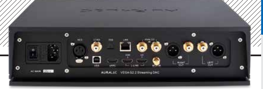
ABOVE: Digital inputs on AES, coaxial and optical (192kHz/24-bit and DSD64 over DoP) are joined by wired LAN, USB-B and Auralic Lightning Link ports (384kHz/32-bit and DSD512) plus an external clock input. Line inputs (on RCAs) sit alongside fixed/variable preamp outputs on XLRs (balanced) and RCAs

RAMCD001], with accompaniment from the likes of Christy Moore and Donal Lunny. 'Lord Baker' is made all the more attractive by its ethereal backing and the way Moore and O'Connor's voices work together but still have clarity and character – one rich and resonant, the other not much more than a whisper.